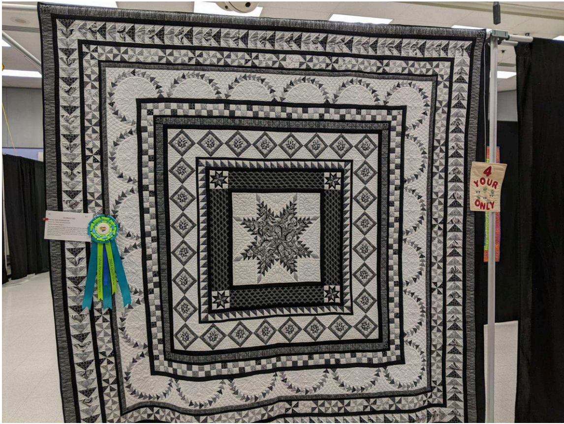
2nd: Linda Baumgartner (Sizzle Squared)