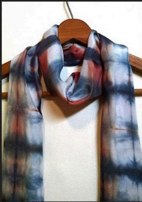
silk scarves (they have their own display like at the holiday market)